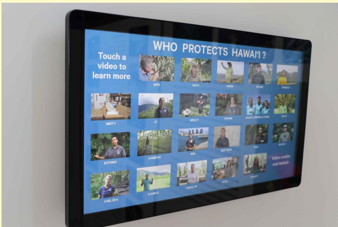
Interactive video segments talk story about invasives.